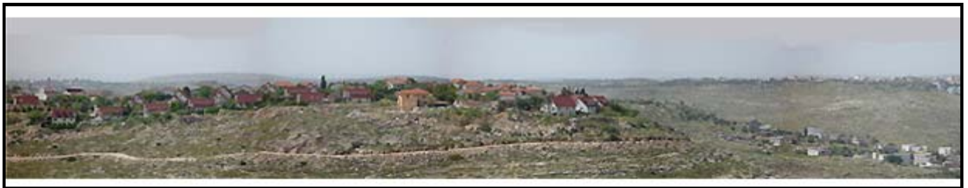
This 270 degree panorama shows the Israeli settlement on a hill overlooking the Palestinian village in the valley

This strategic territorial arrangement has been brought into use recently during the Israeli Army’s invasion of Palestinian cities and villages. Some of the settlements assisted the IDF in different tasks, mainly as places for the army to organise, refuel and redeploy.